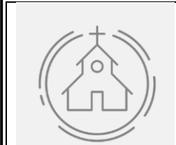
a CHRISTIAN people

The mission of the Church of the Nazarene is to make Christ-like disciples in the nations.