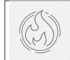
a HOLINESS people